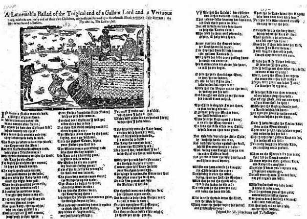
Figure 1 A Lamentable Ballad of the Tragical end of a Gallant Lord and a Vertuous / Lady; with the untimely end of their two Children, wickedly performed by a Heathenish Black-amoor their Servant: the / like never heard of before. The (t)une is, The Ladies fall.

printed ballads, “begun with the acquisition of John Selden’s ballad collection (probably in the 1680s)” 1 comprise 5 albums, and some of the printed sheets were cut down to size in order to fit the albums, but some of them, printed on smaller sheets have been kept intact. The collection is diverse thematically, and most types of ballads are well represented: “Pepys was curious about all the topics of his times, hence his collecting ballads on a variety of subjects: religion, history, the state, the latest murders and executions, drinking and good fellowship, frolics, etc.” (Fumerton Online).